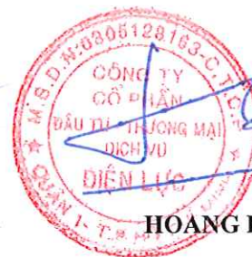
HOANG HUY HUNG