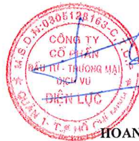
HOANG HUY HUNG